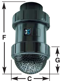
True Check with foot valve screen installed